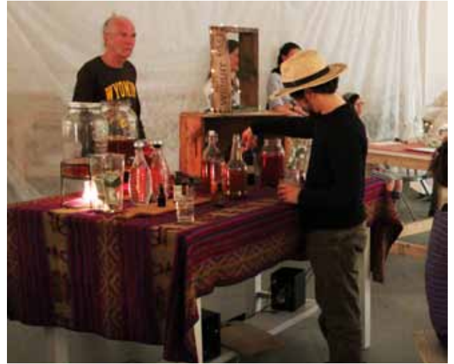
The Alchemical Kombucha and Tincture Bar, The Lazarus Project

with an “Alchemical Kombucha and Tincture Bar.”