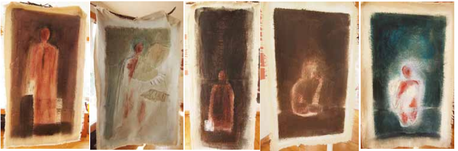
Laura Summer Hanging Figures seven paintings on unstretched canvas 2016 The Lazarus Project installation

would walk by the first three darker paintings toward the pivotal fourth one (the vaguely defined crouching figure) at the point of the “V.” The paintings would be mounted so that viewers then had to make a turn to “exit” or come out of the “V,” where they would meet the last three paintings