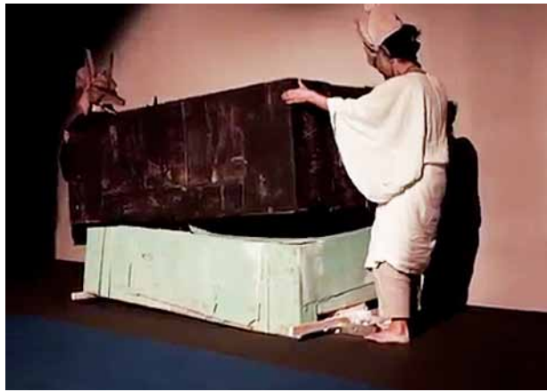
Anubis & Osiris free Lazarus from the first sarcophagus sheath

like Russian dolls (or the threefold lower components of the constitution of the human being). Osiris and Anubis freed Lazarus by “peeling” each sarcophagus away one after the other. The Paradise, Inc. representative then reappeared to call Lazarus back into life/wake him up, reassuring him of his success in activating the heartphone by saying, “You have it.” Then in the final, seventh act (all-video) Lazarus through his own power is able to freely bike on water, realizing he has activated the heartphone, and also taking Osiris and Anubis with him.