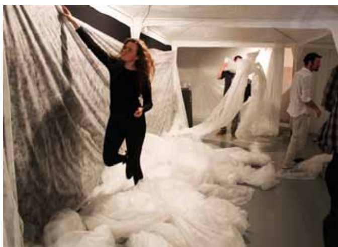
De-installing The Lazarus Project installation