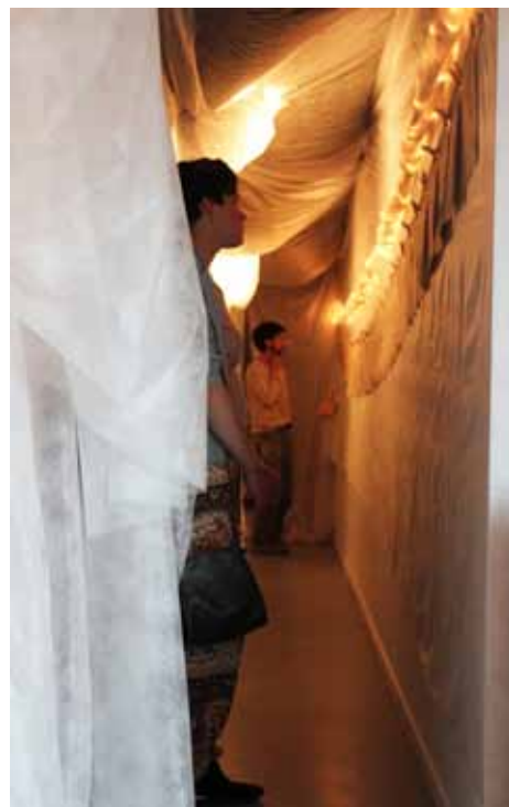
Viewers in the Milkweed Corridor

When you emerged from the seed corridor, you were met with a cylindrical framework contraction on which were mounted paintings of faces done in black and white and strong colors using oil sticks. Each face was half black, half white or half colored, in many different combinations. The circ-