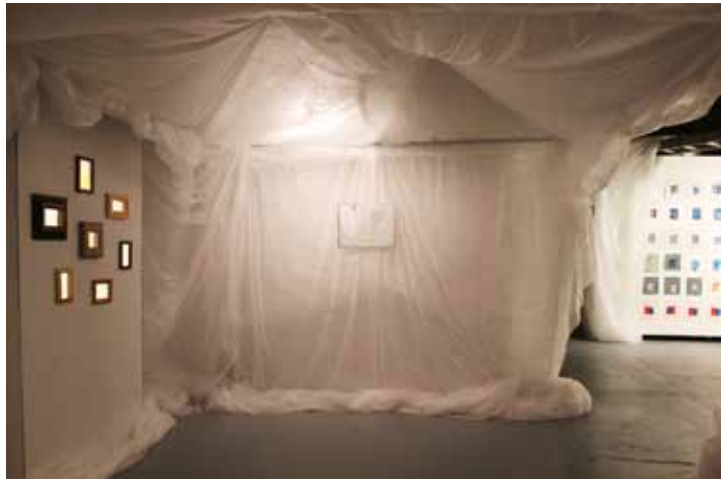
Wall with Optical Frames (left) and Monoprints Dispersal Wall (rear right)