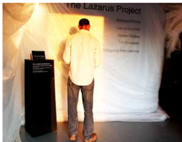
Visitor at entrance to The Lazarus Project by catalog stand