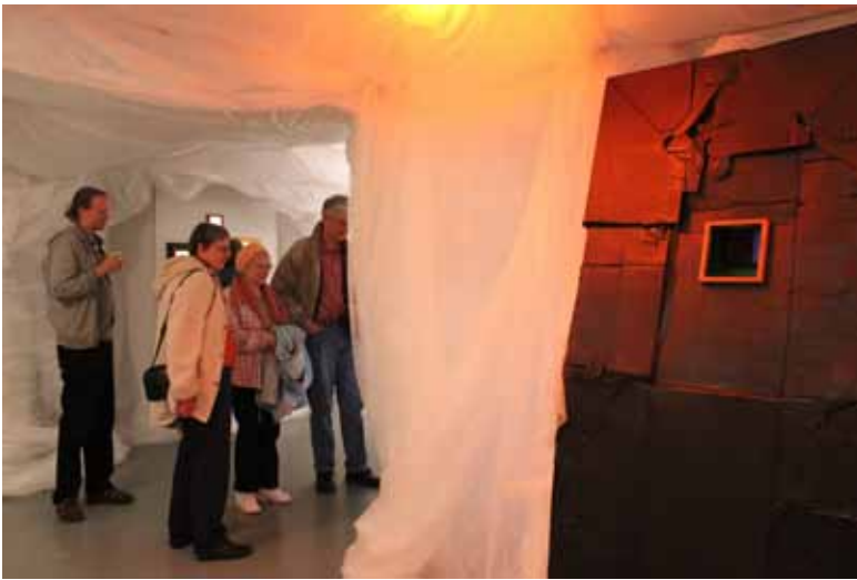
Viewers in The Lazarus Project; threefold sarcophagus with frame on far right

displayed through a documentary screened on a wall. The exhibition was a celebration of all senses! Reading and listening to the texts, looking at and feeling the artwork, and tasting some homemade beverages nourished the mind, body and soul.”