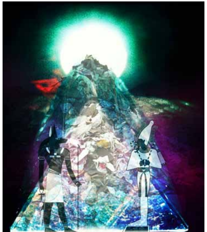
“Trash Pyramid” with Anubis and Osiris, video still

Evangelist, but it seems to me to be more of an artistic transformation of the processes of the story to relate to the somewhat different, contemporary struggles of the artist (and all human beings) to spiritually awaken, using a kind of “initiation template.” The poster for it described the opera as a “multimedia performance about death, initiation, and the heart-phone.”