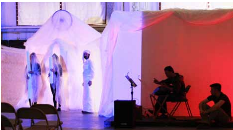
Rehearsing the “Procession” scene from Act 1 of THE TRASHOLD OPERA in Hudson