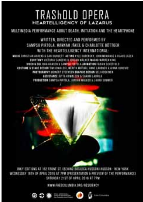
Flyer announcing THE TRASHOLD OPERA