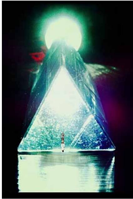
“Trash Pyramid” from Act One, video still

ACT ONE: The performance starts with the appearance of Lazarus as a “bicycling Pharaoh” carried by Osiris and Anubis, who have been enslaved by him. It becomes apparent that Osiris and Anubis are lost in time and space, but in the midst of a scene of the pyramids and the sphinx they suddenly find a mysterious representative of Paradise, Inc. He presents to Lazarus the evolution of communication and the development of the telephone from the landline to the heartphone. The Paradise, Inc. representative points out the time when the smartphone was realized to have had a bad influence on people due its effect on extreme individualism, and how it was replaced by the revolutionary artphone. After a while, people realized that the artphone was as bad as the smartphone, as it was just another extreme. Only recently Paradise, Inc. found the best phone for the contemporary human being: the heartphone.