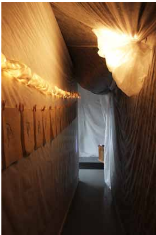
Milkweed Corridor from The Lazarus Project May 2016

Visitors first came upon a series of pencil drawings lining a long, narrow hall. The drawings depicted a milkweed pod drawn on consecutive days in September through October 2015. During the first 18 drawings the pod remains unchanged, and then in October it begins to open. The long walk of the corridor echoed the long process of waiting for the pod to open. At the end of the hall another process started – that of the seed; here the milkweed seed was drawn and the viewer experienced first the waiting and then the