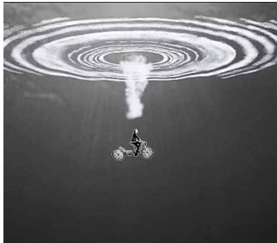
Lazarus sinking beneath the water toward Hades, video still

ACT THREE: In the Escapist Land (Ecstasia) Lazarus meets the Psychology Police, who guide him through the Flee Market, where he changes his bicycle to a tricycle.