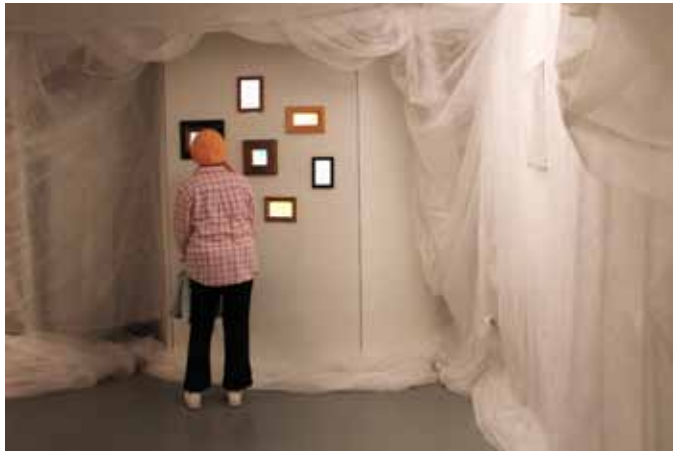
Viewer observing optical frames wall, The Lazarus Project 2016

through them closely, they could see that the large paintings were yet another metamorphic figures series ( Transformation Figures ).