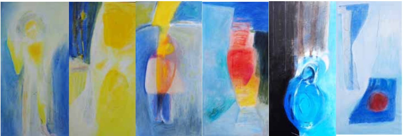
Laura Summer Transformation Figure/Abstract Series seven paintings for inside of the “frames” 2016 The Lazarus Project installation