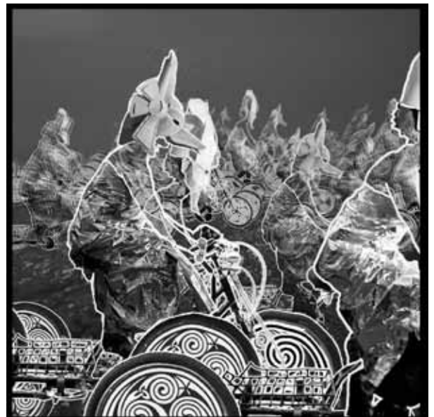
17 The “Tour de Hades” cycling competition, video animation still

We could say that the all-video fourth act/scene that sends Lazarus under the ocean to compete in the “Tour de Hades” was a fall in the opposite, ahrimanic direction. It was only in the sixth act where Osiris and Anubis reappeared on either side of Lazarus inside his dark sarcophagus that redemption/initiation was achieved. In the Berlin performance a video was shown about the life of a human being from end to the beginning (reflecting the after-death reverse review of one’s past life in kamaloka). This was a threefold sarcophagus with each one inside the other