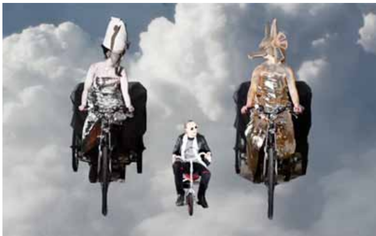
Lazarus finally can cycle through the sky, himself moving Osiris and Anubis

Finally, it occurs to me that one could see the development of Lazarus in the Opera as a kind of partial image or analogue of the initiation process of the new Mysteries of the Will, whereby the light of new understanding and being emerges from the individual’s will achieving a tri-fold, “whole-soul” (i.e., thinking, feeling, and willing) penetration of the various outwardly sense-perceptible “surfaces” of the world to reach, initially, the etheric (water) and astral (air) realities of “cosmic world thought” that lie behind them – as Lazarus had to ride his tricycle over so many different surfaces. [In 1906, GA 94, Steiner also said that in traditional esotericism water represented soul and air represented the higher self, which fits the Lazarus experience even better.]