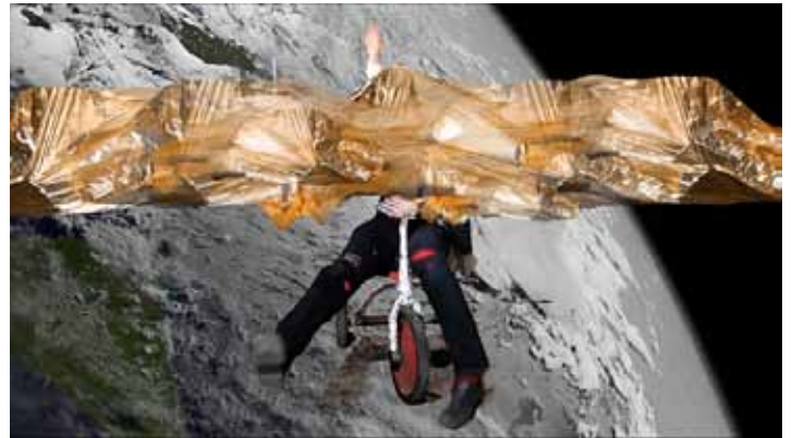
Lazarus flies too near the moon, urged on by luciferic sirens and tries to fight his way through a web of lower astrality surrounding the earth.

started to fear that he would be trapped or captured in this “Ecstasia” [we could also say “luciferic”] reality, and ended up falling down from the sky.