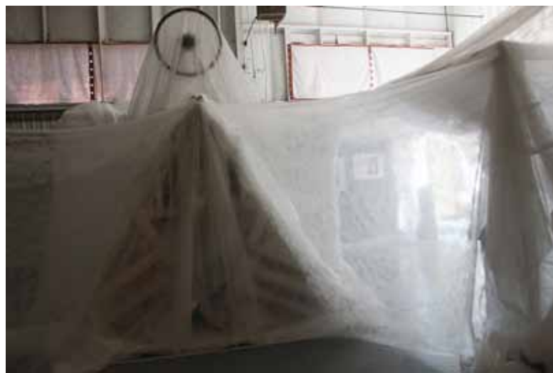
View of “Trash Pyramid” in The Lazarus Project installation May 2016