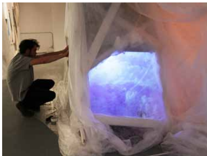
Constructing the “Trash Pyramid” with “Opera” video projection

Emerging into a larger open space, viewers saw that there were also two painting sequences installed on the walls. Both contained metamorphic series of figure transformations ( Hanging Figures and Development of the Heartphone ) with related videos projected within the translucent cloth pyramid nearby, appearing continu-