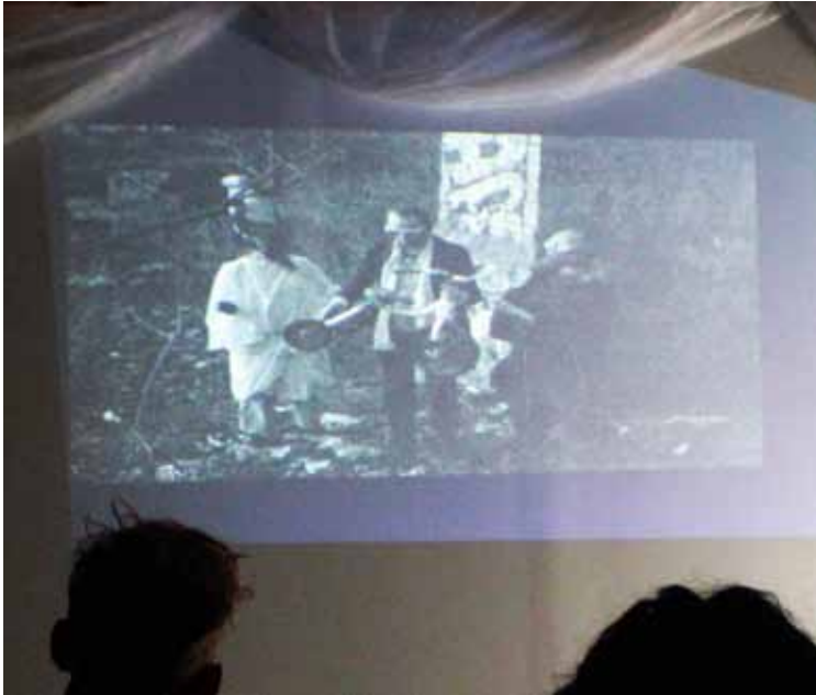
Watching the preview video of Osiris and Anubis in the Escapist Land (Ecstasia) helping Lazarus obtain his special tricycle to pursue his path.