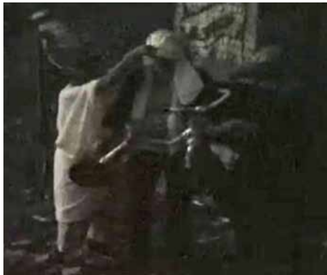
Osiris removing the pharaoh headgear from Lazarus, video still

goes through. . . . It is not trying to be . . . an exact historical or spiritual description . . . but more an artistic and creative image of the qualities involved in this form of initiation process. This experience can also be happening in the future.”