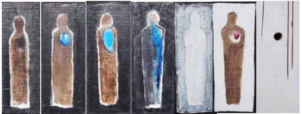
Laura Summer The Development of the Heartphone 7 paintings on woodblocks

There were 22 images of the milkweed pod as it opened, and then, beginning on March 29, there were 15 more images of the milkweed seed sprouting. Laura added to these latter drawings each day of the Lazarus Project.