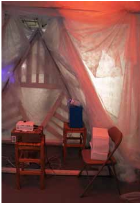
Inside the "Trash Pyramid" with projection tech

ously on four projection surfaces. On the other faces of the pyramid were projected five video images of THE TRASHOLD OPERA produced in a somewhat different version by Sampsa Pirtola in Berlin in March 2016 (three projections and two played on computer screens). One of the sides was constructed from a dark standing sarcophagus (actually three sarcophagi in one, each fitted with a small frame through which one could see another video shown from a computer from Act 6 of the Opera, where the three sarcophagi are opened to liberate Lazarus).