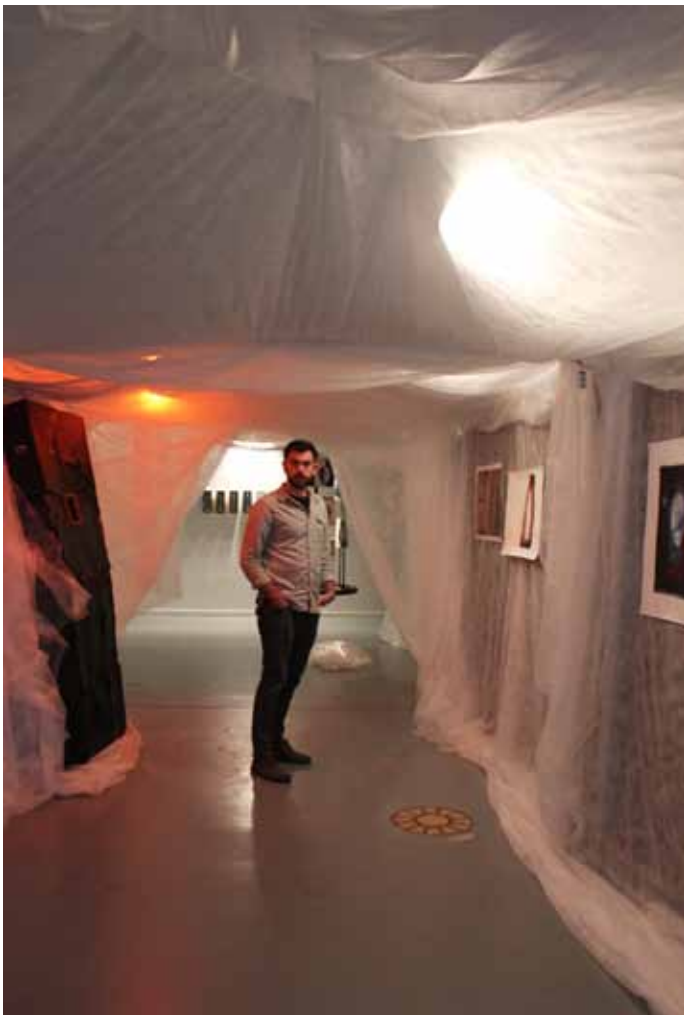
Scene from The Lazarus Project, Hudson, New York May 2016