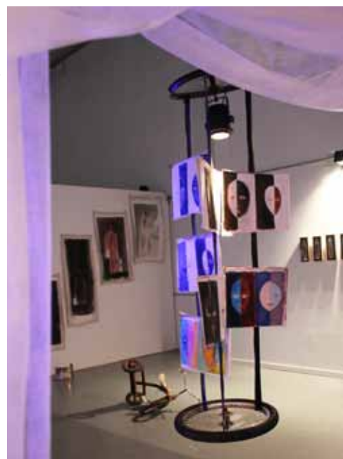
Faces Paintings on Cylindrical Structure

lar contraction moved slightly if pushed. This movement of faces was found again in the “Dance” video from the Opera, projected on the nearby “Trash Pyramid.”