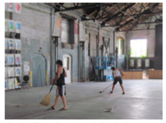
Fig. 86. Closing Event: Nearly Finished

dispersing and saying their farewells (figure 86). The mysterious Tao tones that sounded at the end of our activities pointed toward the future human potentials we had begun to explore. The reappearance of Immanuel for the closing wrapped up the conference as a kind of journey from Ilandea to Tao – two imaginations of human higher potential and creativity that marked the conference. Afterward a small group met to discuss